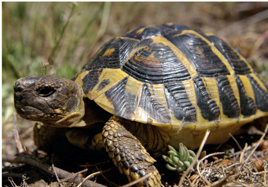
Fig. 1. A healthy western Hermann's tortoise ( Testudo hermanni hermanni ) in its natural habitat: Albera massif.

tortoises in the Serra de l'Albera. This population consists mainly of animals that have never lived in captivity, but in some areas of the Albera mountains, the population has been reinforced by captive-bred tortoises which had been hatched for this purpose in the breeding centre (Centre de Reproducció de Tortugues de l'Albera: CRT).