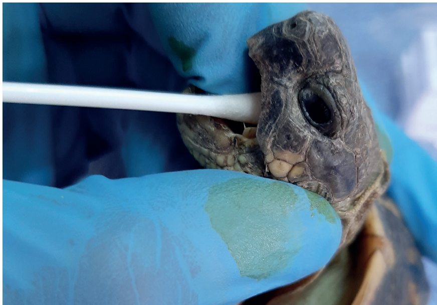
Fig. 2. Taking an oral swab in an adult wild (free-living) tortoise.