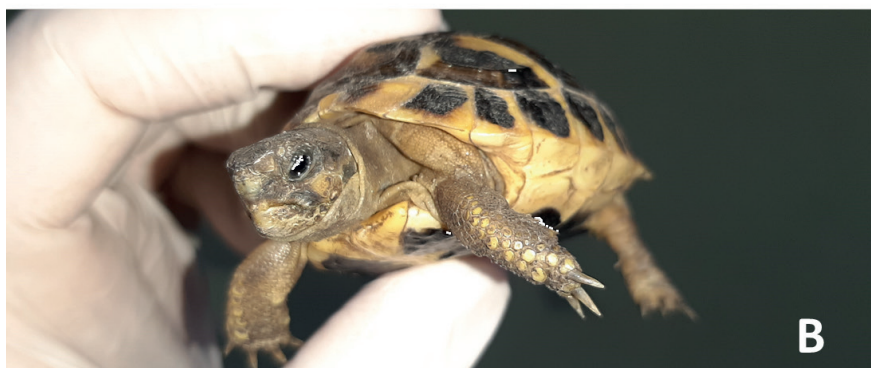
Fig. 5. (A) An obviously soft and deformable carapace and plastron of a hatchling Testudo hermanni affected by tortoise Picornavirus and (B) a healthy, alert and round hatchling of the same species.