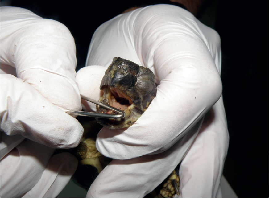
Fig. 4. A captive Testudo hermanni with nasal and oral infection lesions due to Herpesvirus .

the adult tortoises have had the disease, but they survived and are now asymptomatic carriers. However, juveniles of less than three years of age show an elevated mortality when they are infected with Picornavirus , as has been shown in a breeding centre in Catalonia (Martínez-Silvestre et al. 2019a, 2020). While no clinical signs of Picornavirus are observed in the adults, in the offspring of the semi-free-ranging breeding programme the clinical signs were subacute. Sick animals showed a softening of the shell, which was friable and deformable to the touch (Figs 5 & 6); they stopped growing and were sluggish. In the days before death the tortoises stopped eating, closed their eyes and no longer moved their legs, and the whole animal seemed to bulge. If cystocentesis (puncturing of the urinary bladder) was performed, an excess retention of urine could be observed. Post-mortem examinations revealed renal disease as well as an alteration of the carapacial bone structure, which is consistent with the findings after artificial experimental inoculation of Picornavirus in Testudo hermanni and T. graeca (Paries et al. 2019). As a result, we fear that this virus may actually be affecting the conservation of Testudo hermanni more seriously than the other pathogens for which we tested. Recently, it has been detected that this virus forms a distinct subgroup within the Picornaviridae, and has been classified as a new genus: Torchivirus (Marschang 2019).