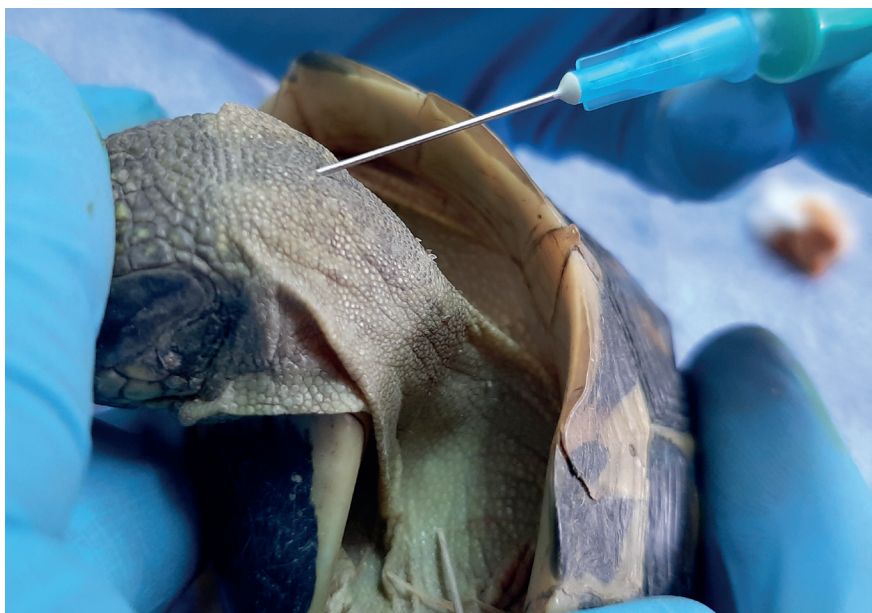
Fig. 3. Taking a blood sample from the occipital sinus of an adult free-living tortoise.